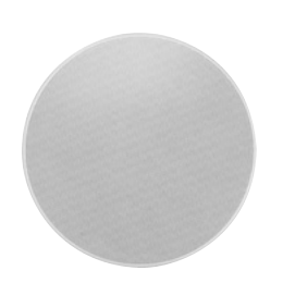
PART# Large 92615 Medium 92612 Small 92609 UOM PAIR

The one-piece grille is made of perforated steel and plastic.