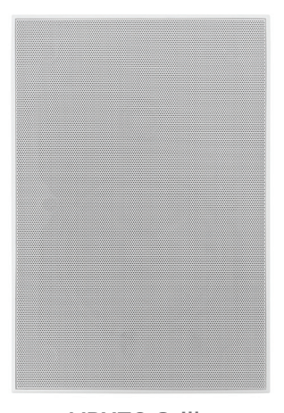
VPXT6 Grille Front