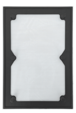
VPXT6 Grille Back